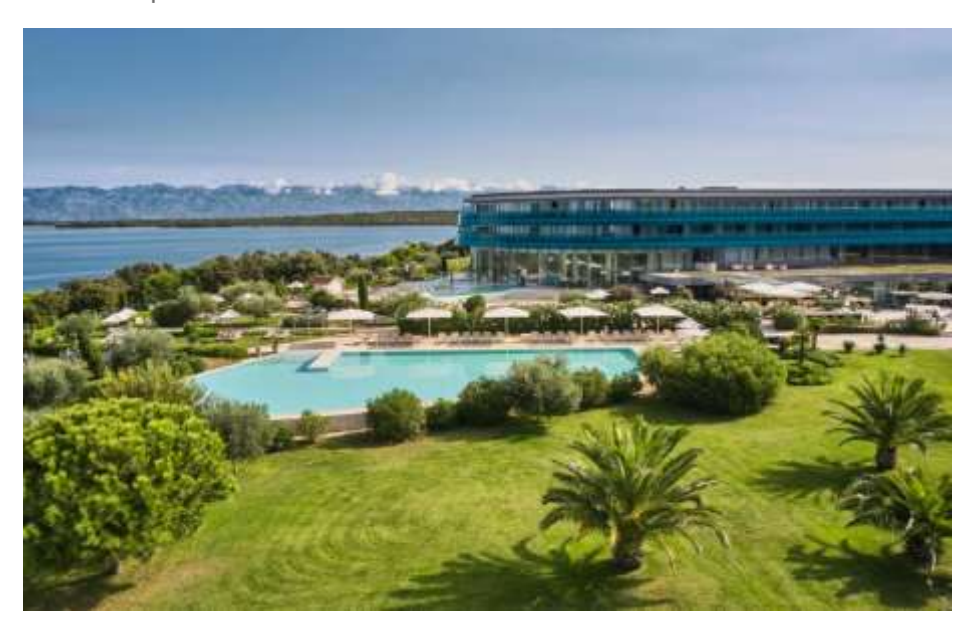
Resort Punta Skala Map